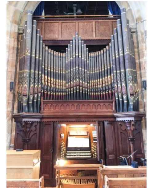
The magnificent organ which will be installed in Saville Street as part of the plan to create a Community Hub

The Old Rectory became an Arts Council accredited museum in 2009 and the restoration work is still continuing. It attracts some 5,000 visitors a year from both near and far.